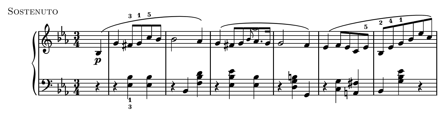
F.CHOPIN 1840 Opus Posthumous